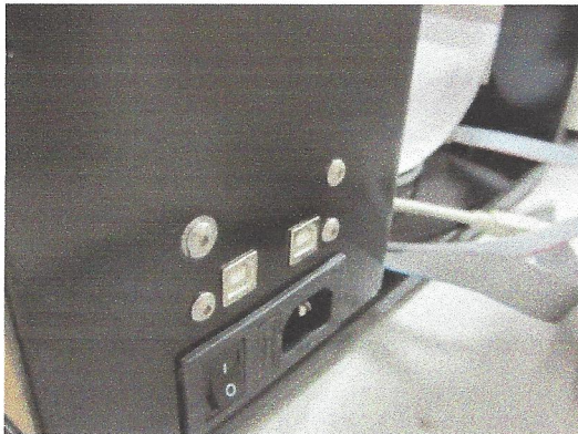
Old USB Connections